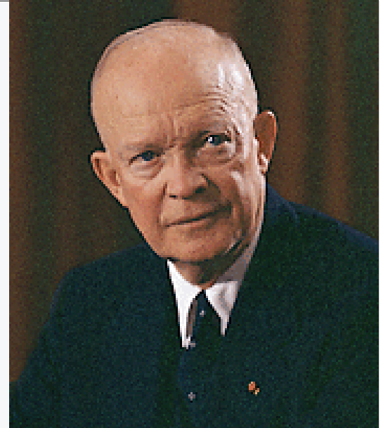
Dwight D. Eisenhower

NOW, THEREFORE, I, DWIGHT D. EISENHOWER, President of the United States of America, do hereby designate Thursday, May 1, 1958 as Law Day - USA. I urge the people of the United States to observe the designated day with appropriate ceremonies and activities, and I especially urge the legal profession, the press, and